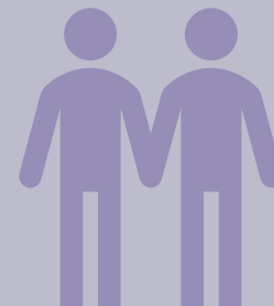
Peer Recovery Advocate