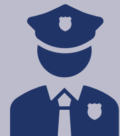
Law Enforcement 8